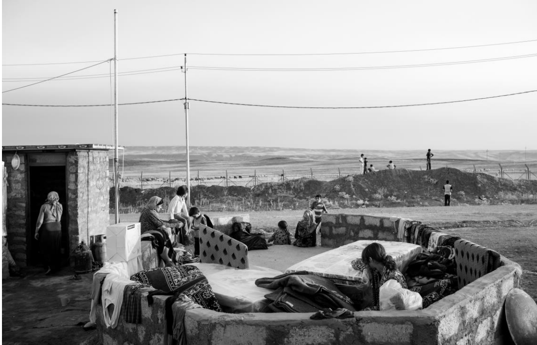
Yazidis who fled their homes in the Sinjar region take shelter at Bajid Kandal IDP camp in Dohuk governorate. 7 August 2014.

Other crimes committed by IS against the Yazidi community include the destruction of several important Yazidi temples and shrines and the looting and destruction of Yazidi homes. 29 An extensive retrospective survey has calculated that in August 2014 alone, IS killed 3,100 Yazidis and abducted 6,800 more. According to this survey, children under the age of 14 made up 33.7% of the total abductees. 30 According to Al-Monitor , the United Nations Investigative Team to Promote Accountability for Crimes Committed by Da'esh/Islamic State in Iraq and the Levant (UNITAD) stated at a Baghdad press conference in April 2020 that 73 mass graves of Yazidis have been found in Iraq since 2014, 13 of which have been exhumed. 31 The Kurdistan Regional Government's Office of Kidnapped Yazidis, based in Dohuk, estimated that as of February 2020, 2,884 Yazidi adults and children remain missing. Many of these adults and children are believed to still be in IS captivity. 32