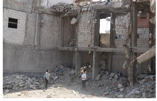
Me, right, standing in the rubble of a building in Raqqa, Syria. More than 80% of the city was destroyed.

We need donations to keep documenting potential war crimes – whether they're in Syria, Yemen, or Sudan. <u>And if you</u> <u>organise a fundraiser now and send us the donations by 30</u> <u>April, every pound could be matched by a generous partner of</u> <u>Amnesty International UK*.</u>