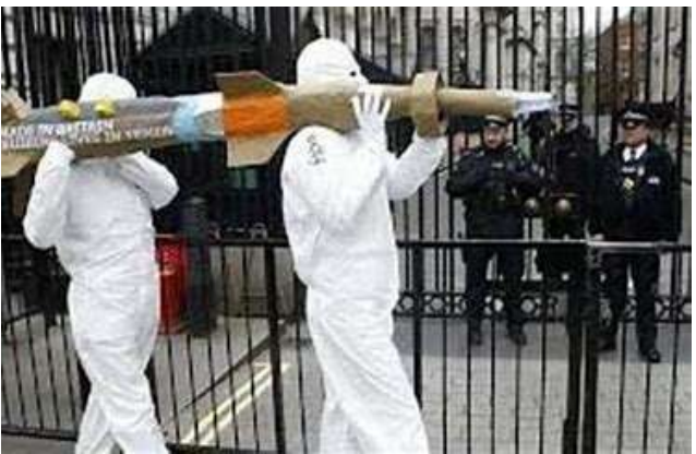
An image from a stunt organised by Amnesty outside Downing St.

The Communication focuses on the role of the following companies: Airbus Defence and Space S.A.(Spain), Airbus Defence and Space GmbH (Germany), BAE Systems Plc. (UK), Dassault Aviation S.A. (France), Leonardo S.p.A. (Italy), MBDA UK Ldt. (UK), MBDA France S.A.S. (France), Raytheon Systems Ltd. (UK), Rheinmetall AG (Germany) through its subsidiary RWM Italia S.p.A. (Italy), and Thales France.