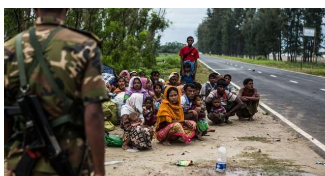
Civilians in Myanmar under military surveillance

Amnesty is calling on all sides to respect international humanitarian and human rights law, protect civilians, and ensure humanitarian access. It is also calling onto the UN Security Council to refer the situation in Myanmar to the International Criminal Court.