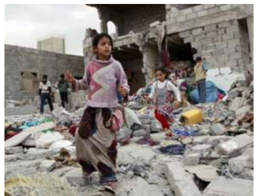
Children among destroyed civilian building in Yemen

As a group we will carry on sending letters to our MPs, reminding them of the Government's duty to abide to the UK's Court ruling and to international humanitarian law. If you cannot come to meetings, a sample letter can be emailed to you on request.