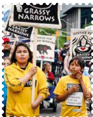
Case 2. CANADA Grassy Narrows youth page 7