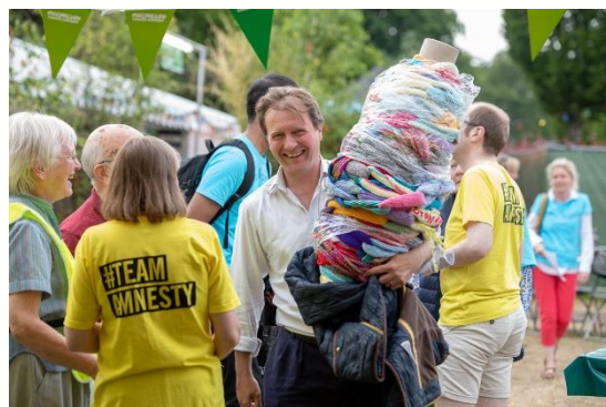
Nazanin's husband Richard at the event

Another way the Cardiff Group raise money is through a voluntary group subscription, which raises close to £400 every year.