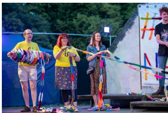
Cardiff Group members unraveling the Knit for Naz chain

GET IN TOUCH: fundraise@amnesty.org.uk / 020 7033 1650