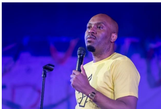
Dane Baptiste on stage