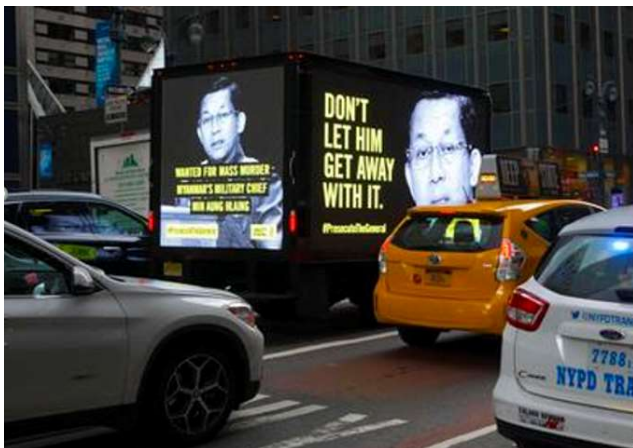
An image of Amnesty's campaign in New York calling for accountability of Myanmar's military

Amnesty added that it is disappointing that the UN Security Council continues to abdicate its responsibility to refer the situation to the International Criminal Court (ICC) and has invited the Security Council to the situation in Myanmar on its agenda until this is done.