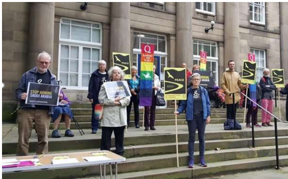
Some of our members and Manchester's Quakers protesting against arming Saudi Arabia in Sep 19