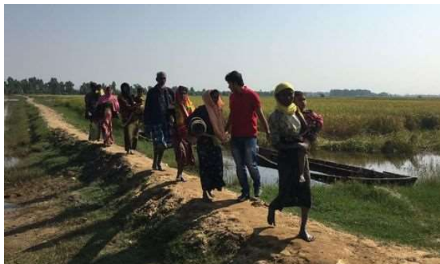
Rohingyas fleeing their homes two years ago.

Amnesty International has warned that Rakhine State remains unsafe while those responsible for the violence continue to evade justice.