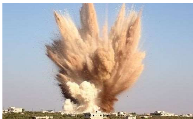
Image of a civilian facility being bombed in Idlib

In August the UN Secretary General António Guterres stated that he will establish a "board of inquiry" to investigate attacks that have taken place during the Syrian government's offensive on the province of Idlib.