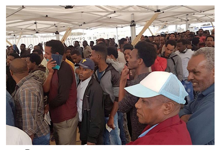
Oueue outside the PIBA offices in Bnei Brak