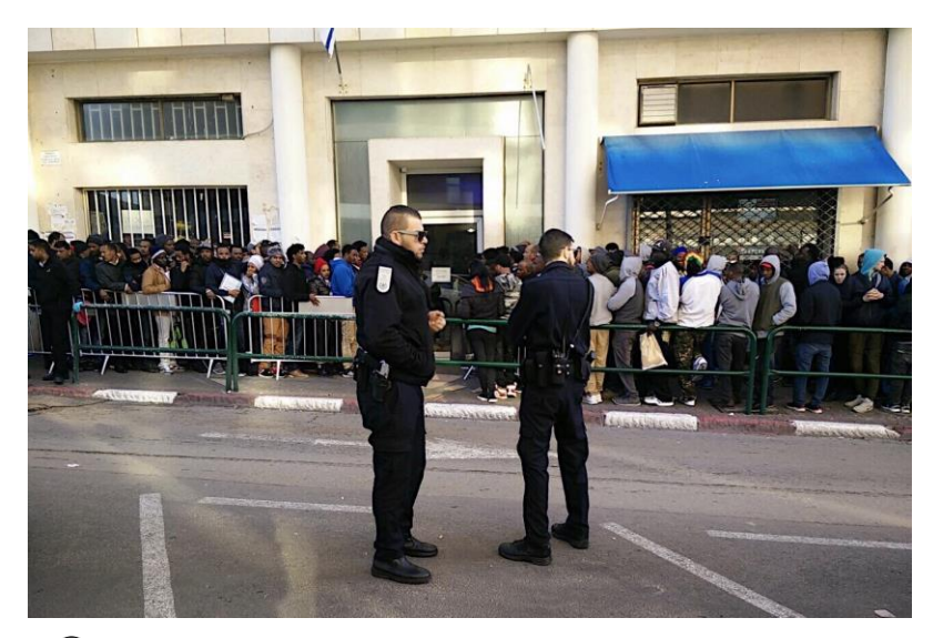
♠ ↑Queue outside the PIBA offices in Tel Aviv

Amnesty International visited the RSD Unit office in Tel Aviv about 20 times in 2017 and early 2018; after January 2018, when the office was transferred to Bnei Brak, a city just east of Tel Aviv, the organization gathered information, photos and videos through its contacts there. The organization's observers saw queues of hundreds of people forming outside the Unit's Tel Aviv office, forcing people to spend the night in the street to be first in line. Even when reaching the top of the queue, asylum-seekers from Eritrea and Sudan were often refused entry, as the security guards arbitrarily refused entry to those with a valid resident visa, telling them to return once their visa expired. Amnesty International observed that, on average, only 10-12 asylum-seekers from Eritrea or Sudan were admitted into the office on any given day. On average, more than 200 asylum-seekers would be denied entry and left outside of the office.