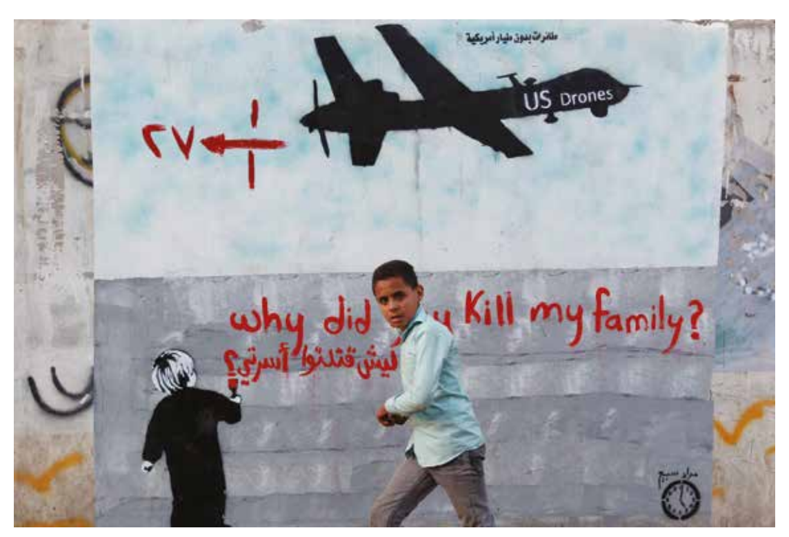
A Yemeni boy walks past a mural depicting a US drone on December 13, 2013 in the Yemeni capital Sana'a.

prevailing circumstances.<sup>61</sup> Unlawful and deliberate killings carried out by order of government officials or with their complicity or acquiescence amount to extrajudicial executions; they are prohibited at all times and constitute crimes under international law.<sup>62</sup>