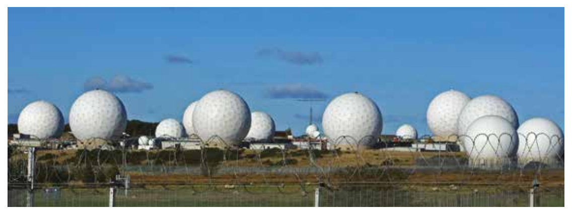
The radar domes of RAF Menwith Hill in north Yorkshire on 30 October, 2007, Harrogate, England.