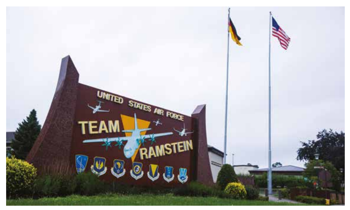
The flags of the United States and Germany fly behind a sign at Ramstein Air Base in Ramstein-Miesenbach, July 30, 2014.

According to classified slides provided by US intelligence sources as part of that investigation, Ramstein sits at the heart of a complex network of facilities across the USA and the globe, through which "most paths within America's drone maze run".<sup>227</sup>