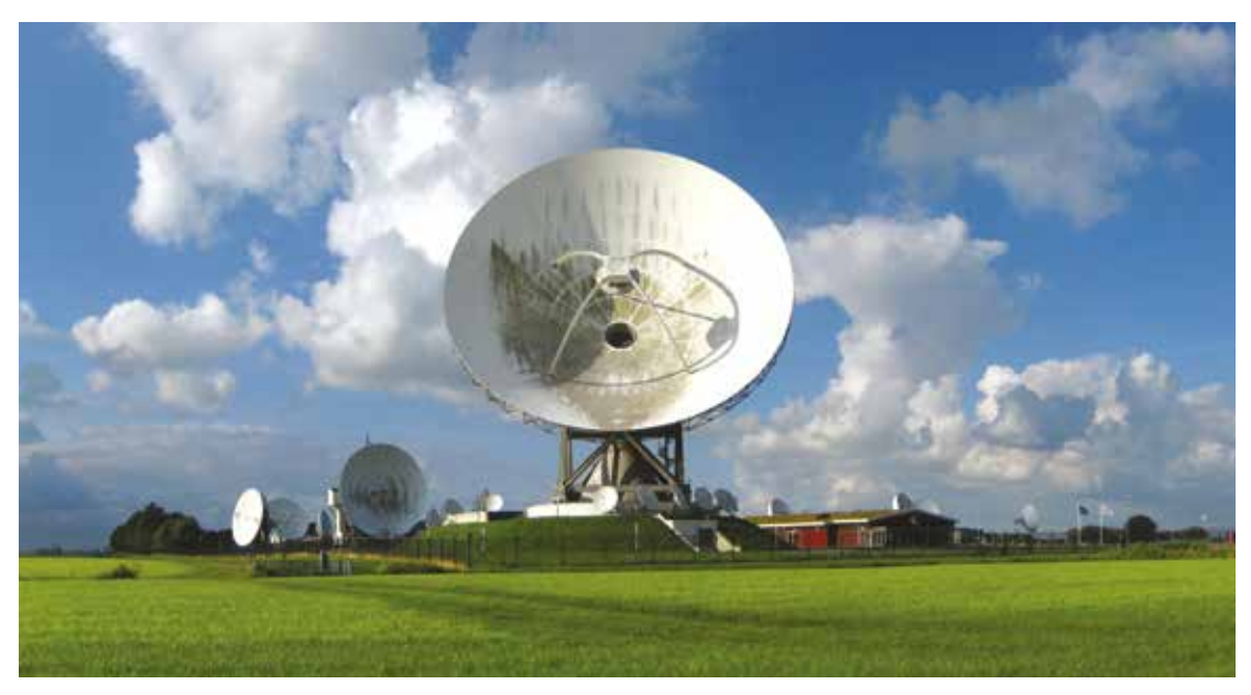
The ground station of the Dutch Nationale SIGINT Organisatie in Burum, the Netherlands, from where the Netherlands collects metadata from Somalia.