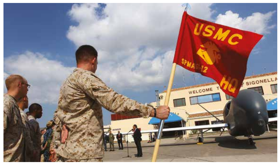
Then US Secretary of Defense Leon Panetta addresses personnel in front of a drone at the Sigonella Naval Air Station on October 7, 2011 in Sigonella, Italy.