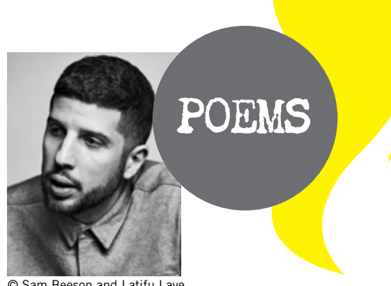
© Sam Beeson and Latifu Lay

the blood, the blood will always be made of blood.