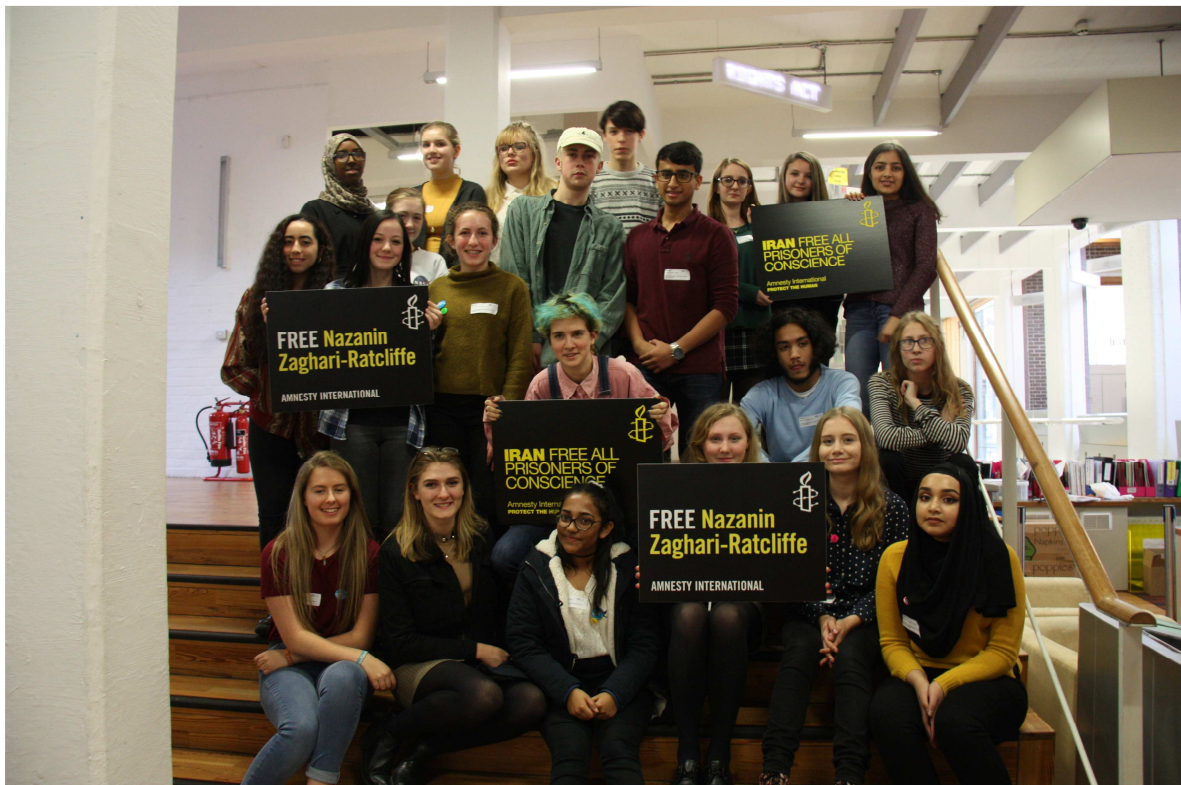
Youth Advisory Group 2016-17