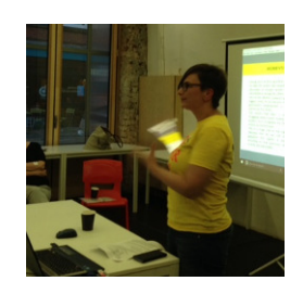
You will both be missed but we wish you all the best for the future.