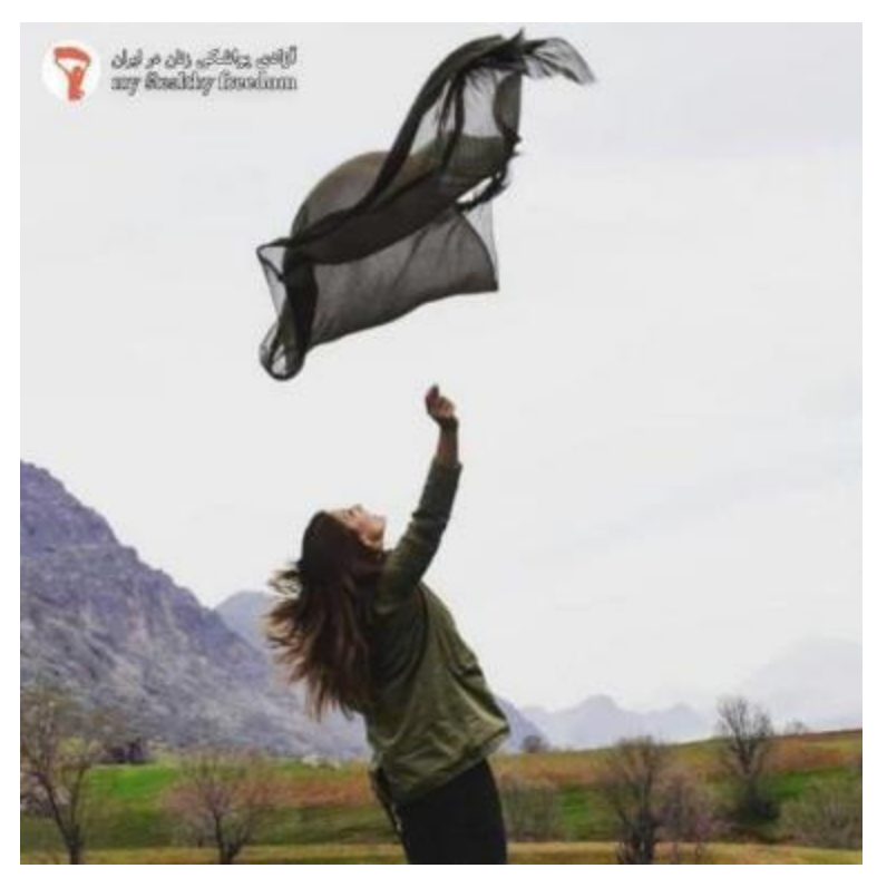
Picture from a woman in Iran rejecting compulsory hijab

Human rights defenders speaking out against compulsory hijab have also been accused of "insulting Islam" and threatened with harsh penalties ranging from imprisonment to the death penalty.