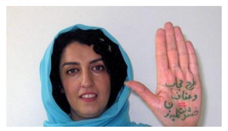
Narges Mohammadi with "compulsory hijab policy equals violence against women" written on her palm

The crackdown on women human rights defenders has also included harsh responses to women who oppose compulsory veiling ( hijab ), claiming women's rights to freedom of belief and religion and freedom of expression. State media regularly use derogatory terms such as "sluts", "deviant" and "corrupt" to demean and degrade these women.