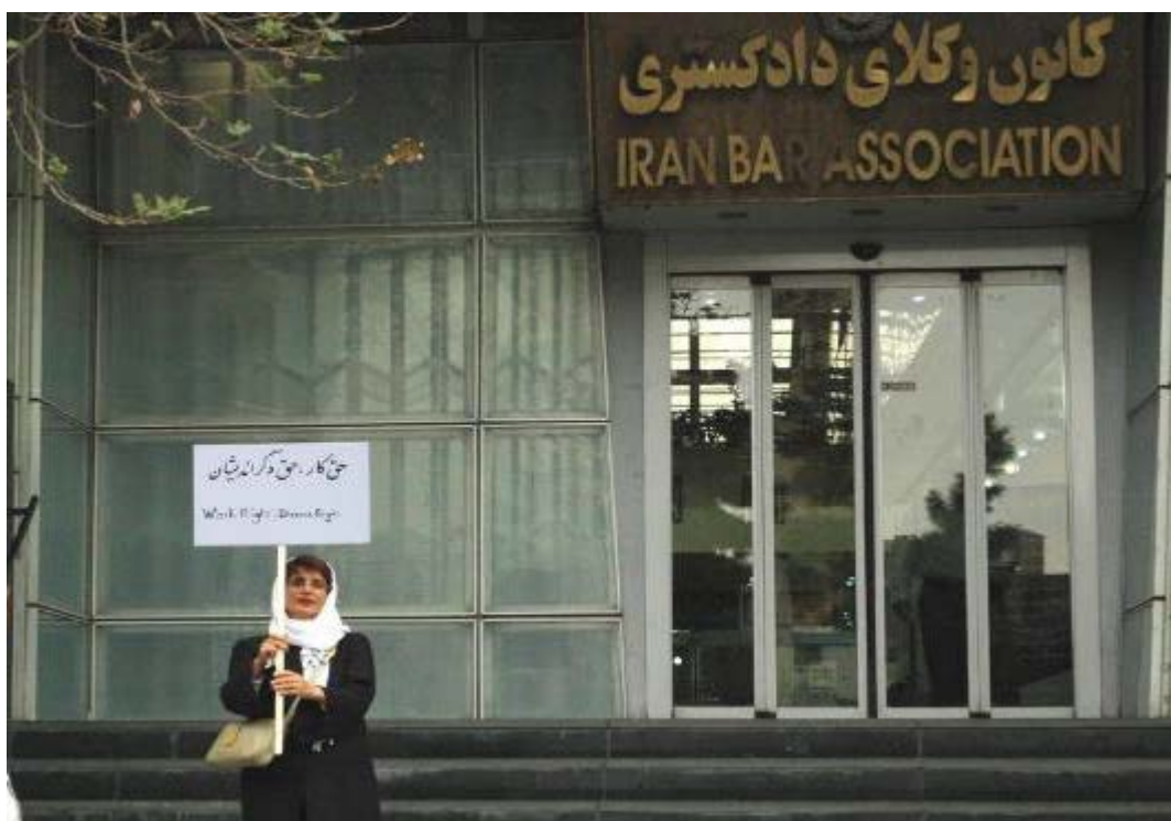
Human rights lawyer Nasrin Sotoudeh protesting outside the Iranian Bar Association