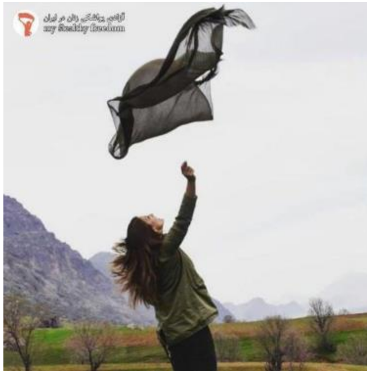
Picture from a woman in Iran rejecting compulsory hijab

Human rights defenders speaking out against compulsory hijab have also been accused of “insulting Islam” and threatened with harsh penalties ranging from imprisonment to the death penalty.