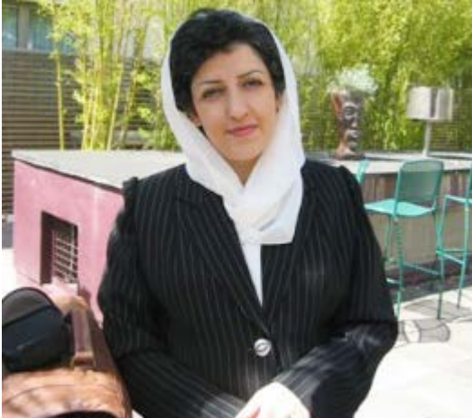
Human rights defender Narges Mohammadi

“Narges Mohammadi really cares for the suffering of others. Whenever she heard that a prisoner was due for execution, she did everything in her power to save them; if she did not succeed, then she joined the family of the death row prisoner in front of prison and stayed with them behind prison walls till dawn [when executions are carried out in Iran].”