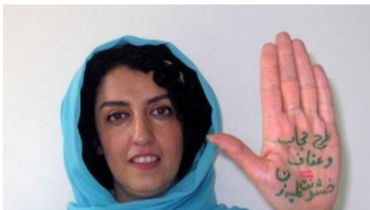
Narges Mohammadi with "compulsory hijab policy equals violence against women" written on her palm

The crackdown on women human rights defenders has also included harsh responses to women who oppose compulsory veiling ( hijab ), claiming women’s rights to freedom of belief and religion and freedom of expression. State media regularly use derogatory terms such as “sluts”, “deviant” and “corrupt” to demean and degrade these women.