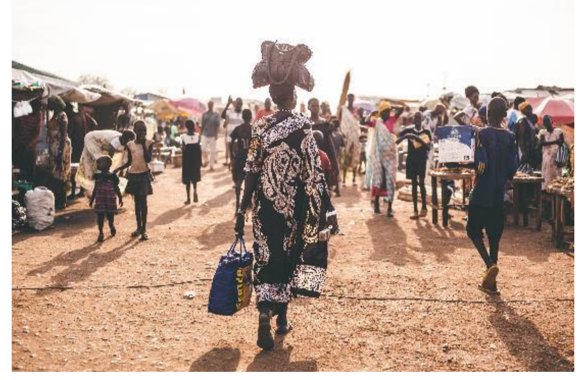
A woman carrying luggage on her head walks through the Protection of Civilians site in Juba, South Sudan.

Most of the cases investigated for this report involved rape or gang rape of women and girls, which often lasted for hours and left victims with serious injuries – both physical and psychological. Some rapists aggravated their crimes by other acts of cruelty, such as mutilating victims with knives or raping them with objects such as sticks. Some killed their victims outright while others left them bleeding, seemingly indifferent to whether they lived or died. Elderly women, young girls, and pregnant women have not been spared.