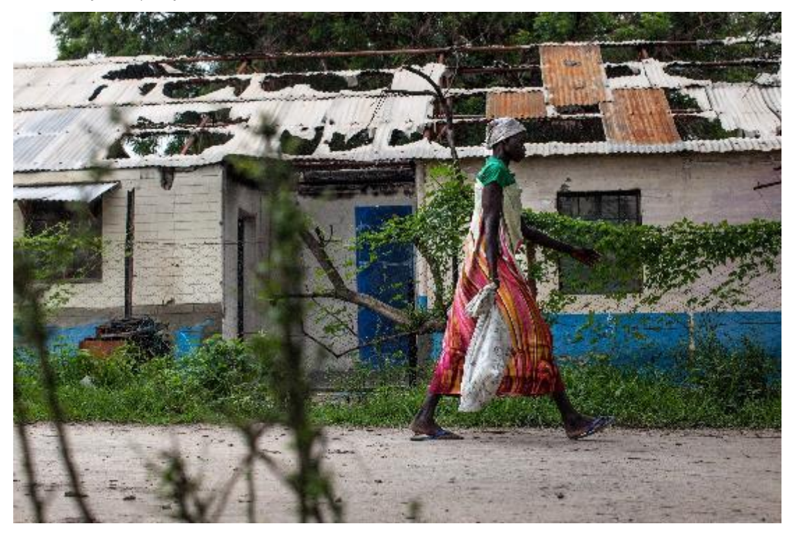
A woman walks on 7 July 2014 past one of the buildings of the Leer Hospital that was burned during the fighting. Hundreds of thousands of people were cut off from critical, lifesaving medical care after the Leer Hospital, run by Médecins Sans Frontières (MSF-Doctors Without Borders), was ransacked and destroyed between the final days of January and early February.

South Sudan, with support from international donors, must take steps to increase the availability, accessibility and quality of mental health services for survivors of sexual violence.