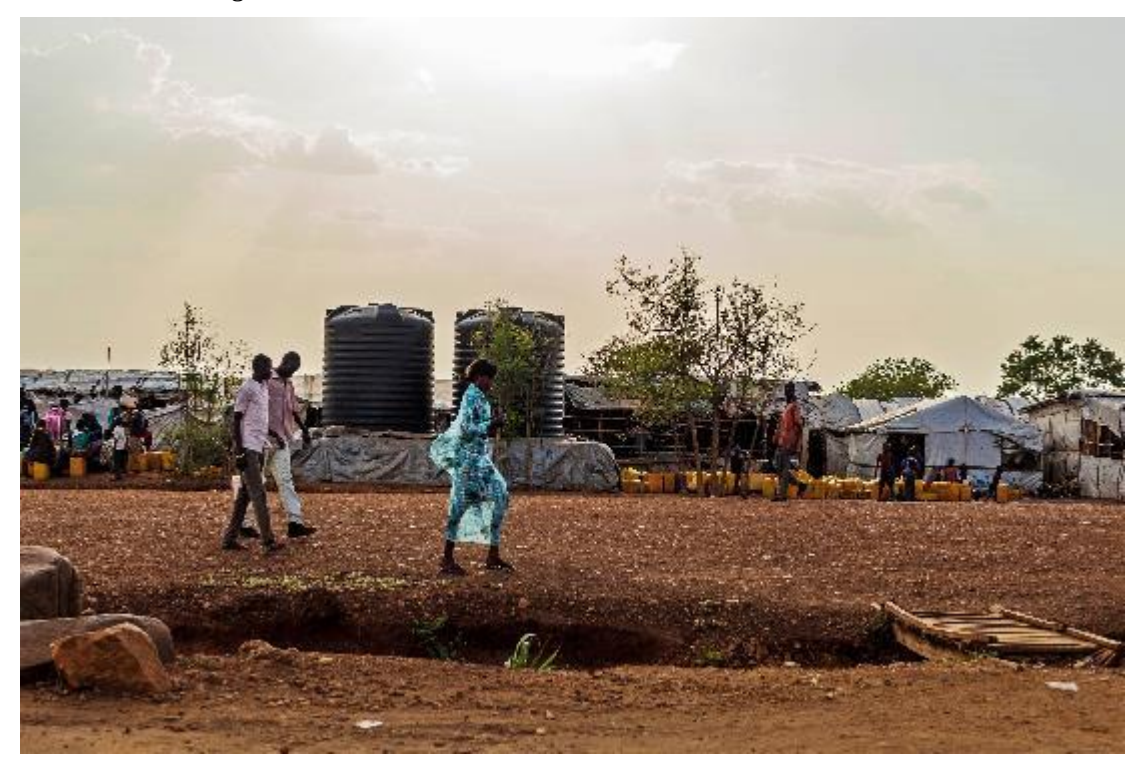
People walk through the Protection of Civilians site 3 in Juba, South Sudan.

The fighting that occurred between government and SPLA-IO forces in Juba between 8 and 11 July was marked by serious violations and abuses of international human rights law and international humanitarian law. Government soldiers deliberately killed civilians, fired indiscriminately in civilian neighbourhoods and around UN bases and PoC sites, and engaged in a massive campaign of looting civilian and humanitarian property. During the July 2016 violence in Juba, the government and SPLA-IO forces committed acts of sexual violence against women and girls. Most cases of sexual violence were committed by government soldiers, police officers and members of the National Security Services (NSS), particularly at checkpoints and during house-to-house searches.<sup>135</sup> In one highly publicized case, government soldiers raped and gang raped at least seven women, including foreign humanitarian workers, during an 11 July attack on the Terrain hotel in the Jebel neighbourhood.<sup>136</sup>