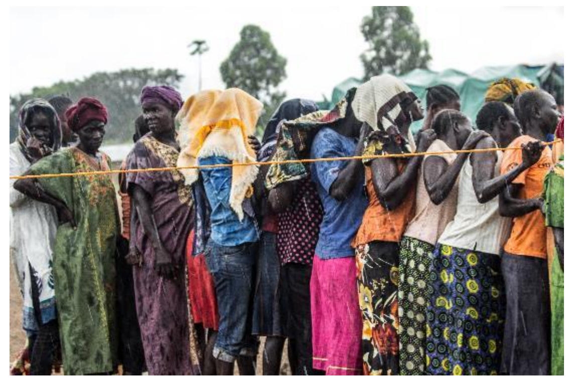
A group of women stand in the rain waiting to be registered and receive their refugee status at Kuluba collection point, Arua district, northern Uganda.

Both the incidents that occurred during the second civil war and the endemic levels of sexual violence during the current conflict can only be fully understood when placed in the longer-term context of gender dynamics within South Sudanese society. Sexual violence is facilitated by the overall status of women and girls in South Sudanese society as subordinate to men, and the resulting discrimination that they experience in their everyday lives. It is also motivated by patriarchal structures and gendered concepts of power which position men as "protectors" of women.