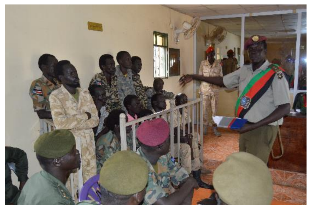
Preliminary hearing in a military court trial of government soldiers accused of rape, murder, and looting at the Terrain hotel in Juba, in July 2016. Juba, South Sudan, 30 May 2017.

In 2014, the Government of South Sudan signed a joint communiqué with the UN Special Representative to the Secretary-General on Sexual Violence in Conflict, Zainab Bangura, in which it committed to address conflict-related sexual violence through measures including the issuance and enforcement of clear orders through military and police chains of command prohibiting sexual violence, accountability mechanisms, exclusion of perpetrators from the security forces and from amnesty provisions, and enhanced services for survivors.<sup>222</sup> A focal point on sexual violence was established within the Presidency, and a working group formed to follow up on recommendations, but generally little concrete progress has been made towards implementation of these commitments.<sup>223</sup> One exception is a command issued in December 2016 by the then Chief of General Staff Paul Malong instructing all soldiers to stop and prevent sexual violence.<sup>224</sup> This as mentioned earlier may have contributed to the reduction of incidents of sexual violence around the UNMISS PoCs in Juba.