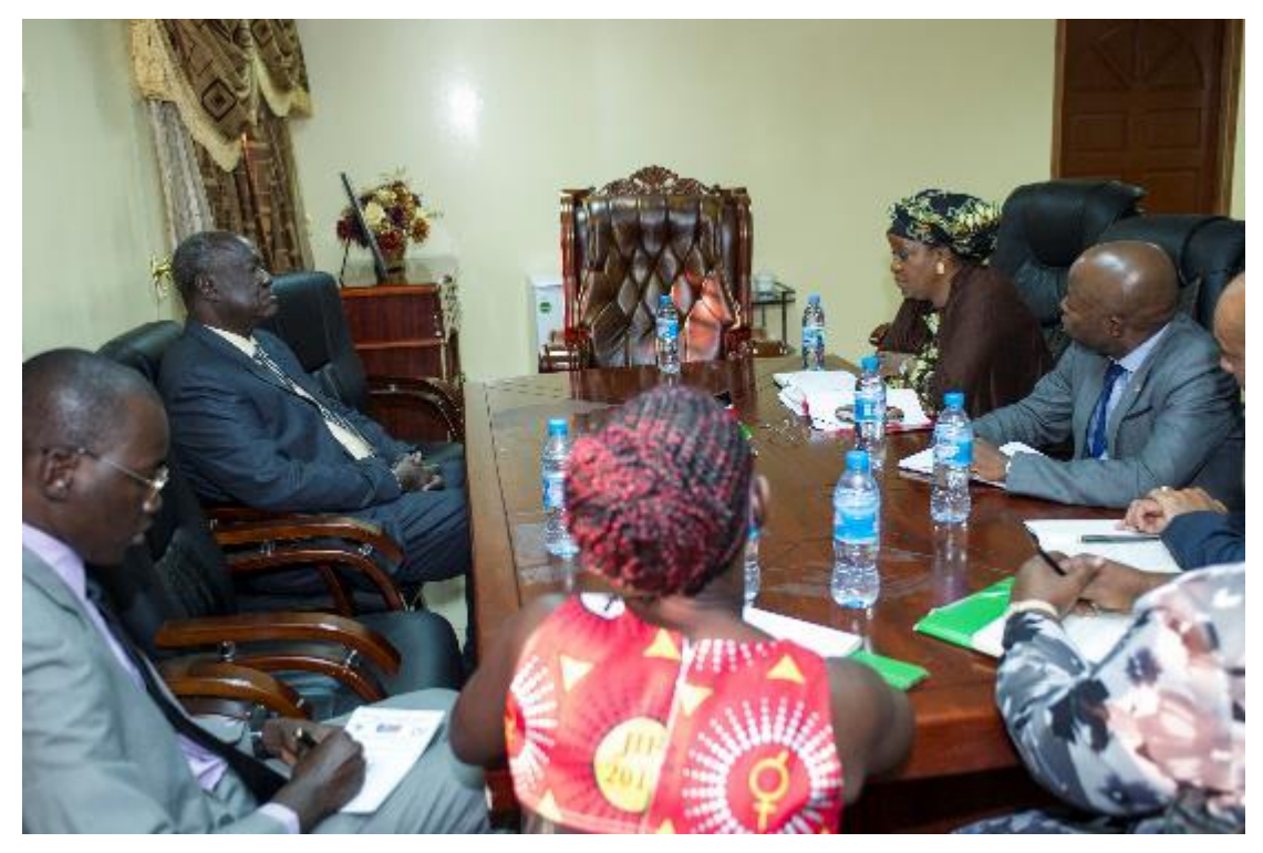
Zainab Hawa Bangura (top right), Special Representative of the Secretary-General on Sexual Violence in Conflict, meets with Kuol Manyang Juuk (top left), Minister of Defence of the Republic of South Sudan. Juba, South Sudan, 2014.