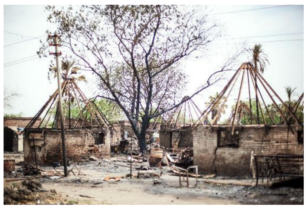
Burned down houses behind Malakal Teaching Hospital, South Sudan, 2014.

Fighting first erupted in Malakal on 24 December 2013. Following heavy clashes, SPLA-IO forces, including members of the White Army, took control by the next day. Malakal town subsequently changed hands another five times, before falling under government control on 19 March. As elsewhere, the early fighting in Malakal was brutal, and involved killings of civilians, extensive looting and destruction of civilian property, as well as sexual violence, particularly gang rape.<sup>91</sup> The examples of sexual violence below all took place before the end of December 2013.