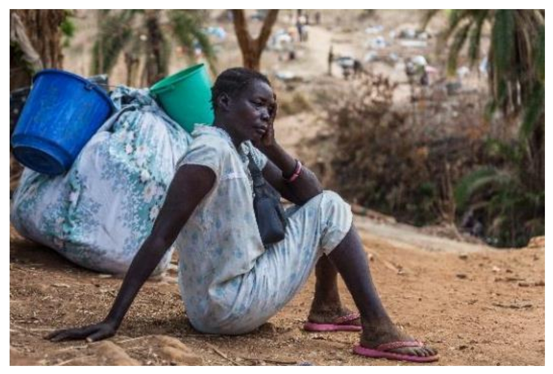
A woman rests next to her luggage before crossing Kaya stream near Afoji town, Moyo district, northern Uganda.

Attacks between government and opposition forces have resulted in the mass displacement of civilians and emptied entire towns and villages in Yei, Lainya, Kajo Keji, Morobo and other towns close to the Uganda and Democratic Republic of Congo border.<sup>162</sup> In December 2016, the Commission for Human Rights in South Sudan said that there was already a steady process of ethnic cleansing under way<sup>163</sup> and that the Equatoria region had become the epicentre of conflict.<sup>164</sup> Uganda is hosting over 900,000 South Sudanese refugees, out of the 1.5 million being hosted within the region. Thousands of refugees continue to cross the border into Uganda each day – in March 2017, the average number of new arrivals was 2,800 per day.<sup>165</sup> Refugees in northern Uganda who had fled Central Equatoria described to researchers for this report acts of sexual violence perpetrated both by government forces as well as by the opposition.