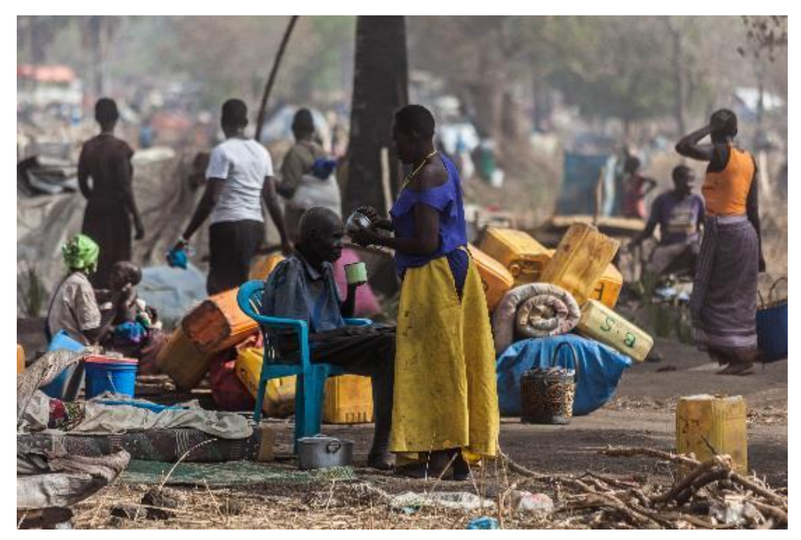
Palorinya refugee settlement in Moyo district, Uganda, 2017.

The conflict has taken an enormous toll on civilians, costing the lives of an unknown number of people.<sup>22</sup> Approximately 1.9 million South Sudanese are internally displaced, with over 200,000 living in camps – called Protection of Civilians (PoC) sites – protected by UN peacekeepers and on UNMISS bases.<sup>23</sup> Another 1.6 million people have fled their homes and sought safety in neighbouring countries as refugees.<sup>24</sup> An estimated 4.9 million people – more than 40% of the total population – are food insecure, and in February 2017, famine was declared in Leer and Mayandit counties.<sup>25</sup> Civilian access to humanitarian assistance is constrained by the ongoing fighting and by intentional obstruction of humanitarian access by parties to the conflict, particularly the government.<sup>26</sup>