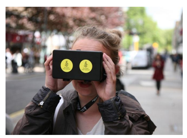
AIUK Syria Update July 2015

Amnesty have recently been using virtual reality (VR) headsets to show what the devastated street of war-torn Aleppo look like.