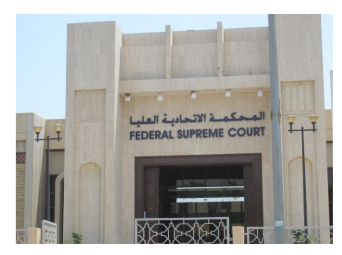
Federal Supreme Court, Abu Dhabi, UAE.

The Federal Supreme Court, whose judges are appointed by executive decree, has shown itself to be neither independent nor impartial when trying cases brought largely under broad and sweeping national security provisions in the Penal Code or the cybercrimes or counter-terrorism laws. Trials