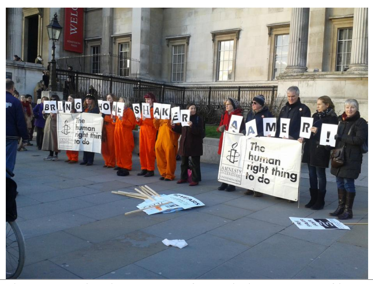
Brighton and Hove, Lewes and Maidstone Groups join forces at the demonstration in Trafalgar Square

On 11th January thirty members of the Lewes Amnesty Group and the Brighton and Hove Amnesty Group travelled up to London for the 12th Anniversary demonstration to call for the closure of Guantanamo.