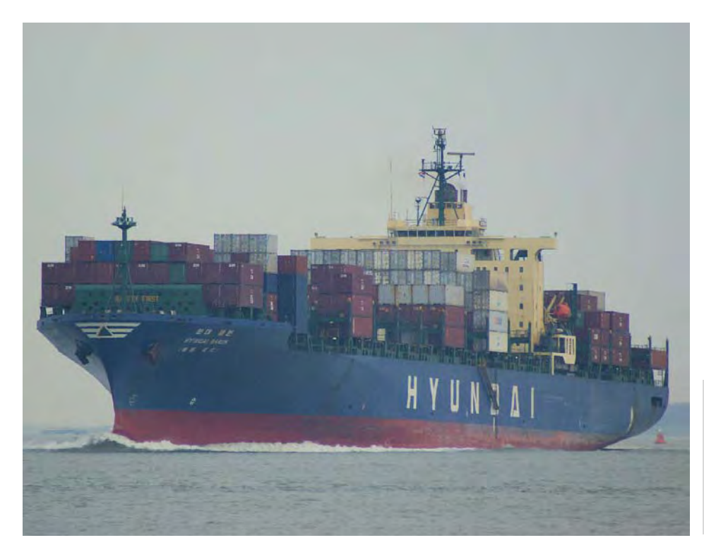
MV Hyundai Baron, which transported components of 155mm K-310 cluster munition artillery shells to Pakistan in April 2009

The UK passed legislation in October 2008 which effectively prohibits UK individuals and companies, including UK-registered companies, from doing "any act calculated to promote the supply or delivery" of a range of prohibited weapons, including cluster munitions and their components, "where that person knows or has reason to believe that such action or actions will, or may, result in the removal of those goods from one third country to another third country."35 Amnesty International contacted Zodiac Maritime Agencies Ltd in December 2009 expressing the organisation's concerns that a cargo carried on one of their vessels may have consisted of components for K310 cluster munitions, noting the relevant UK legislation, and requesting further details about the cargo.<sup>36</sup> Nonetheless in February 2010 revenue authority documents show that a further 1.515 metric-ton consignment from Poongsan Corporation of inert components for K-310 artillery shells - again described in detail on shipping documents as 4 pallets of "OF155MM K310 TP PROJECTILE (DUMMY)" – was transported to Karachi by the MV Hyundai Emperor, another UK-flagged vessel listed on the fleet list of Zodiac Maritime Agencies. 37