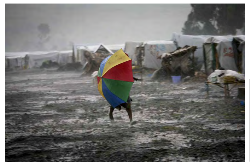
A woman caught in a rain storm in the Kibati camp north of Goma in eastern DRC, 4 November 2008. Many of those in Kibati camp had been displaced by fighting between the CNDP and the DRC armed forces

Forces, including facilitating the supply of arms, and reported complicity in the recruitment of adult and child CNDP fighters within Rwanda.<sup>42</sup> This continued a pattern over many years of Rwandan military support for armed groups in the eastern DRC, including supplies of arms and military support to the CNDP's predecessor group, the Rassemblement Congolais pour la Démocratie-Goma (RCD-Goma) :<sup>43</sup> support which only appears to have ended in 2009 with the arrest of CNDP leader Laurent Nkunda in Rwanda, the hasty integration of CNDP and other armed group fighters into the DRC armed forces (FARDC), and a subsequent violent joint operation by DRC and Rwandan forces against the FDLR armed group in which serious violations of international humanitarian and human rights law were committed by both armed groups and the DRC national army.<sup>44</sup>